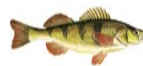
Aborre (DK) Perch (UK) Abbor (N) Perche européenne (F) Perca (E) Perca fluviatilis (Latin)