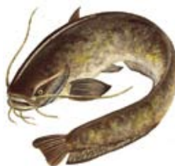
Malle (DK) Steinbit (N) Siluro (E) European Catfish (UK) Silure (F) Silurus glanis (Latin)