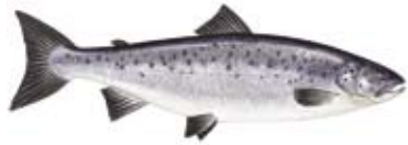
Laks (DK) Atlantic salmon (UK) Laks (N) Saumon atlantique (F) Salmón (E) Salmo salar (Latin)