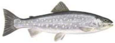
Fjeldørred (DK) Arctic Char (UK) Røye (N) Omble chevalier (F) Trucha alpina (E) Salvelinus alpinus (Latin)