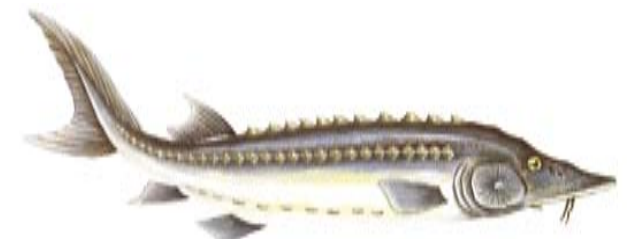
Stør (DK) Hvit stør (N) Esturión blanco (E) White Sturgeon (UK) Esturgeon blanc (F) Acipenser transmontanus (Latin)