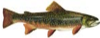
Kildeørred (DK) Brook trout (UK) Bekkerøye (N) Saumon de fontaine (F) Trucha de Fontana (E) Salvelinus fontinalis (Latin)