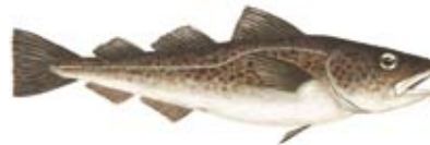
Torsk (DK) Atlantic cod (UK) Torsk (N) Morue (F) Bacalao (E) Gadus morhua (Latin)