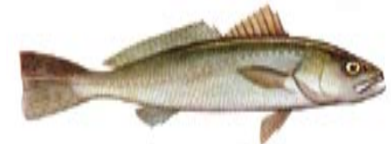
Ørnefisk (DK) Meagre (UK) Ørnefisk (N) Maigre (F) Corvina (E) Argyrosomus regius (Latin)