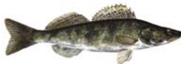
Sandart (DK) Pikeperch (UK) Gjørs (N) Sandre (F) Lucioperca (E) Sander lucioperca (Latin)