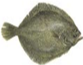
Pighvar (DK) Piggvar (N) Rodaballo (E) Turbot (UK) Turbot (F) Scophthalmus maximus (Latin)