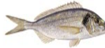
Hav-bras (DK) Gilthead sea bream (UK) Havkaruss (N) Daurade royale (F) Dorado (E) Sparus aurata (Latin)