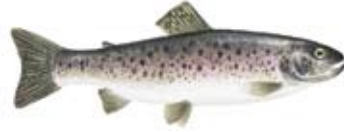
Regnbueørred (DK) Rainbow trout Regnbueørret (N) - seawater /large (UK) Trucha arco iris (E) Truite arc-en-ciel (F) Oncorhynchus mykiss (Latin)