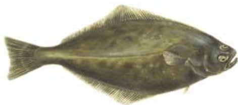
Helleflynder (DK) Kveite (N) Halibut (E) Atlantic Halibut (UK) Flétan (F) Hippoglossus hippoglossus (Latin)