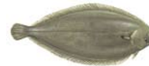
Tunge (DK) Dover sole (UK) Tunge (N) Sole (F) Lenguado (E) Solea solea (Latin)