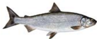
Helt (DK) Powan (UK) Sik (N) Lavaret (F) Lavaret (E) Coregonus lavaretus (Latin)