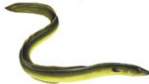
Ål (DK) European Eel (UK) Ål (N) Anguille (F) Anguila (E) Anguilla anguilla (Latin)