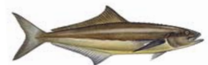
Sergentfisk (DK) Cobia (UK) Cobia (N) Cobia (F) Cobia (E) Rachycentron canadum (Latin)