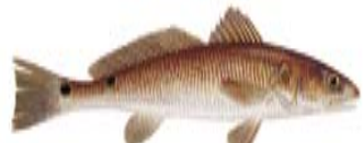
Rød trommefisk (DK) Red Drum (UK) Uer (N) Ombrine tropicale (F) Corvinón ocelado (E) Sciaenops ocellatus (Latin)