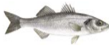
Hav-aborre (DK) European sea bass (UK) Havabbor (N) Bar européen (F) Robaliza (E) Dicentrarchus labrax (Latin)