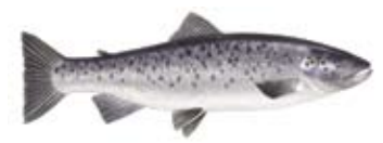
Bækørred (DK) Brown Trout (UK) Ørret (N) Truite fario (F) Trucha Café (E) Salmo trutta (Latin)